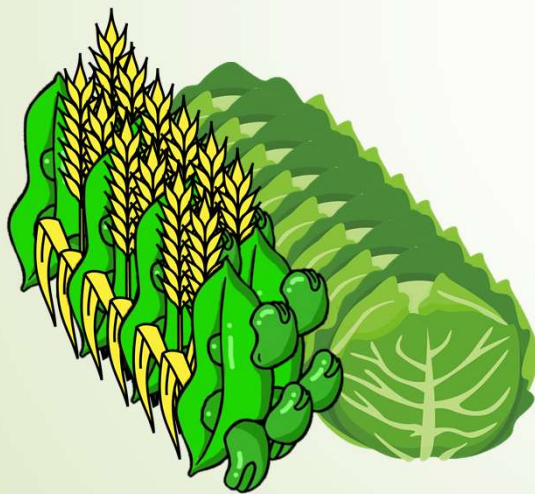
Intercrop with wheat + nectar