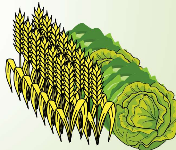
Intercrop with wheat + attractive cultivar